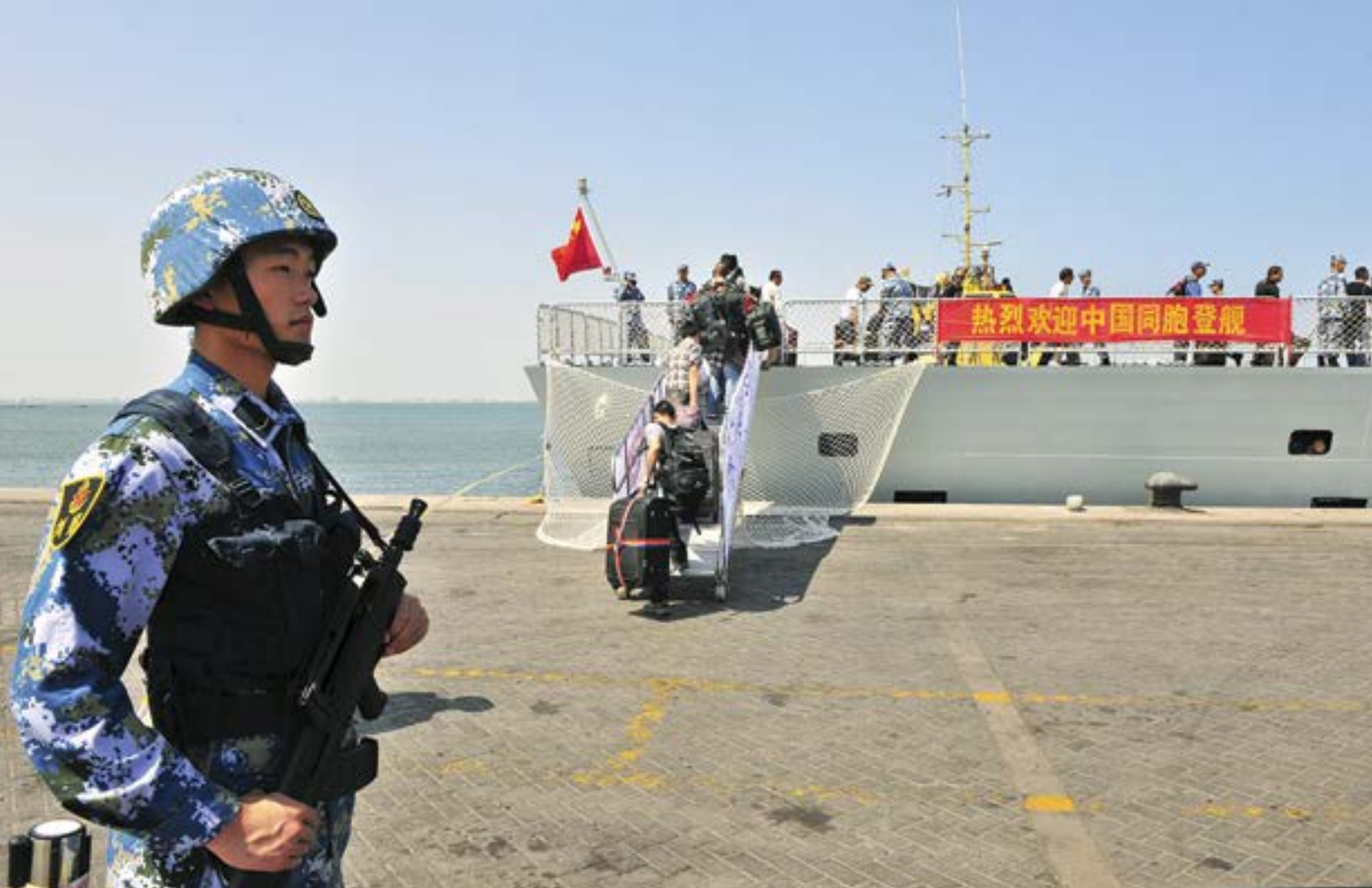
A member of China's People's Liberation Army Navy stands guard as Chinese citizens board the naval ship Linyi during the evacuation of Chinese nationals from Yemen on March 29, 2015.

created tensions. Immediate challenges posed by the proximity of China's military base to US Camp Lemonnier and long-term challenges posed by China's presence in the Bab el-Mandeb Strait and its growing ability to exert control over strategic waterways have also raised concerns in Washington.