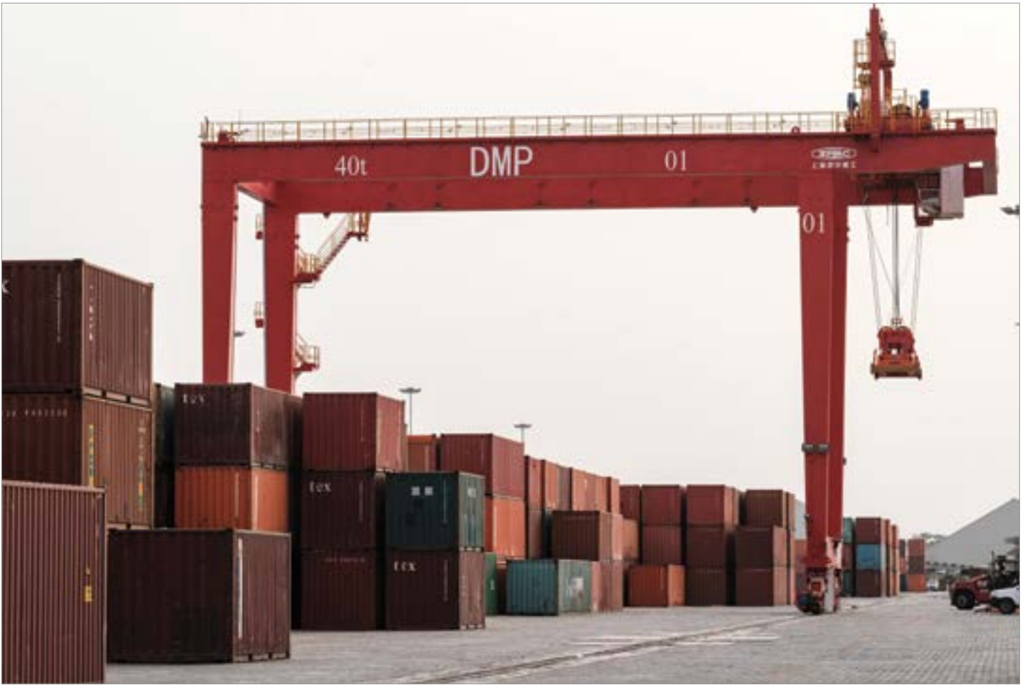
The Doraleh Multi-Purpose Port, which was financed and built in part by China Merchants Port Holdings and sits adjacent to a Chinese naval base, demonstrates the nexus of China's commercial and security interests in Djibouti.

The Doraleh Container Terminal (DCT) is a strategically located major facility on the Red Sea near the Gulf of Aden in which China Merchant Port Holdings has a 25 percent stake. It was built by Dubai-based DP World, which—according to a concession agreement signed in 2006—had rights to operate the facility for thirty years. 67 The Djiboutian government, however, later launched a campaign to renegotiate terms of the deal after DP World built another port in Somaliland, threatening Djibouti's near-monopoly over landlocked Ethiopia's access to the ocean. In 2018, the government of Djibouti unilaterally nationalized the terminal. DP World sued and ultimately won multiple arbitration rulings against Djibouti in the London Court of International Arbitration, though Djibouti has yet to restore the company's rights and benefits to the terminal as demanded by the rulings. 68