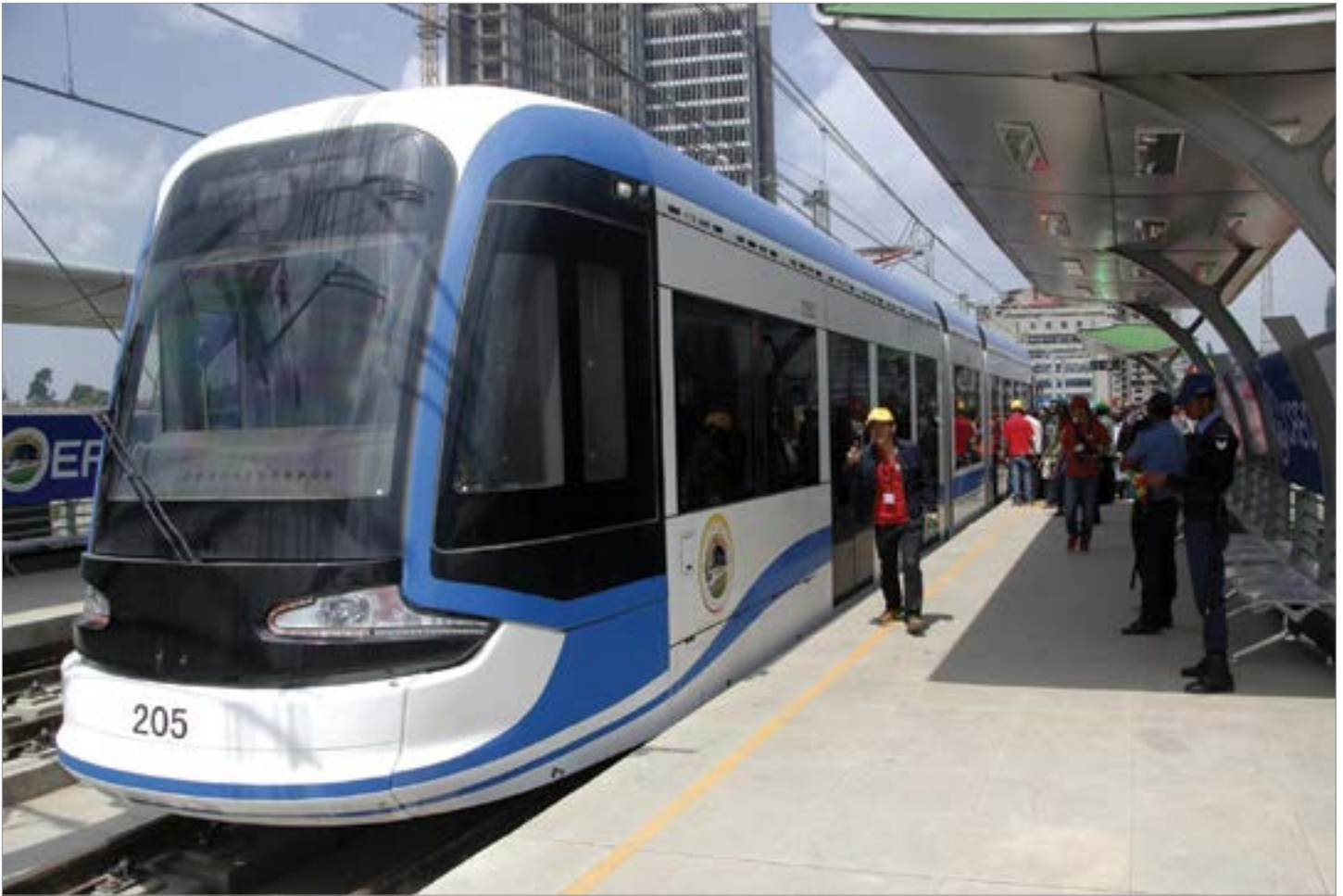
Financed by China's Export-Import Bank and built in partnership with the China Railway Engineering Corporation, the Addis Ababa Light Rail system officially began service on September 20, 2015.

loan repayment deadline for the Addis Ababa–Djibouti railway project by twenty years, causing $1 billion in losses to the state-owned China Export Credit Insurance Corporation. 55