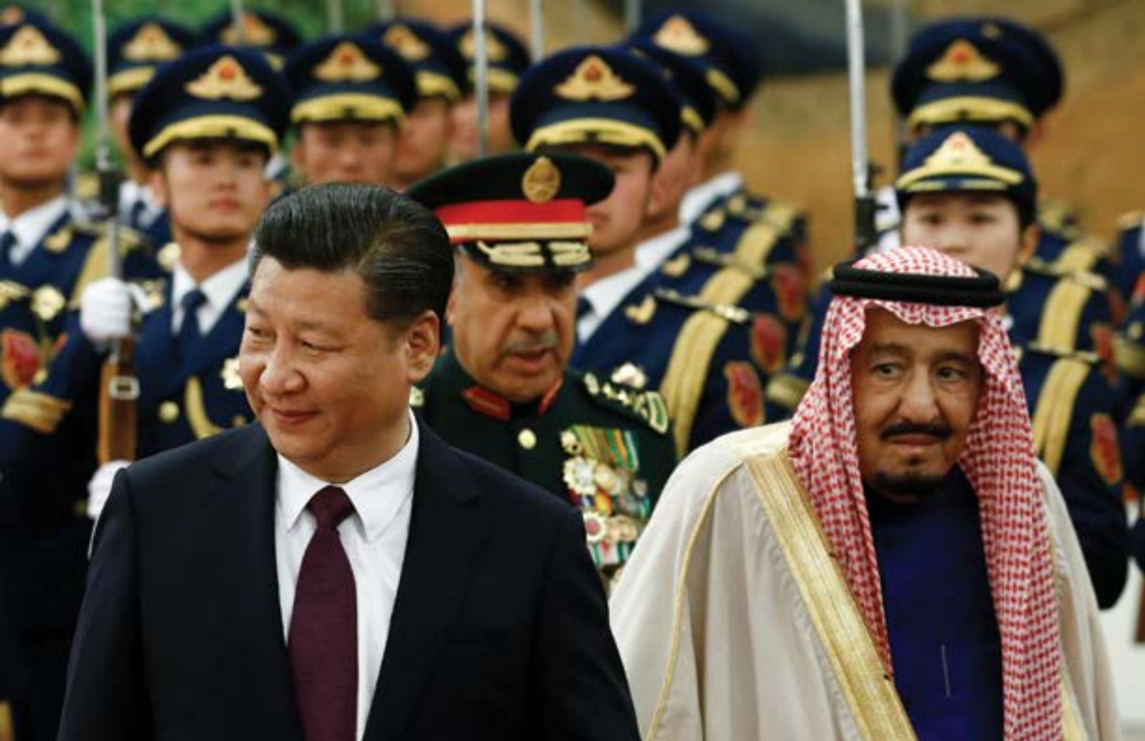
China's President Xi Jinping and Saudi Arabia's King Salman bin Abdulaziz attend a welcoming ceremony at the Great Hall of the People in Beijing on March 16, 2017.

the relationship between China and the UAE has grown closer as cooperation has expanded in several sectors, including trade, technology, and investments.