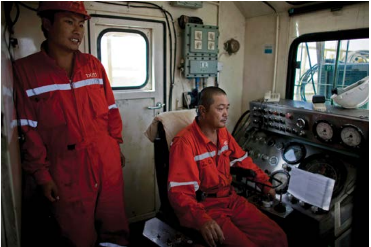
Chinese technicians operate drilling equipment in the Palogue oil fields in November 2010, which were then part of Sudan. Sudan lost 75 percent of its oil reserves to South Sudan upon the latter's independence in 2011.

livestock. 79 China has also financed a number of infrastructure projects in Sudan. Between 2000 and 2011, Sudan saw the launch of approximately sixty-five Chinese-funded infrastructure projects, such as the $1.2 billion Merowe hydroelectric dam, key railway lines, and construction of the presidential palace. 80 Chinese companies have also proposed building several interstate railways, including one that would connect Port Sudan with key locations throughout the Horn of Africa. Sudan has expressed support for the BRI and signed onto the Belt and Road Energy Partnership at the Second Belt and Road Forum in 2019.